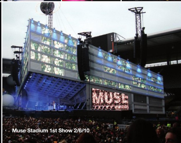
Muse Stadium 1st Show 2/6/10

Brilliant Stages Ltd, 2 Hillgate, Hitchin, Herts SG4 0RY Tel +44 (0) 1462 455366 info@bstages.com